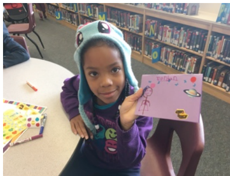
Kinder Tales students proudly showing their accomplishments!