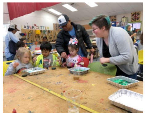
Family Maker Workshop in November—lots going on!