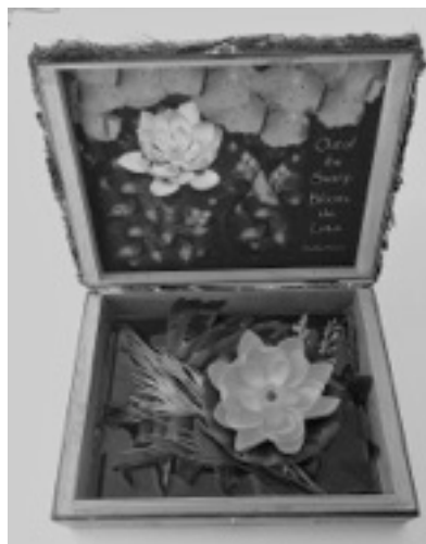
A beautiful altered cigar box by Linda Abernathy, titled “Out of the Swamp Blooms the Lotus.”

President’s Corner continued from page 1