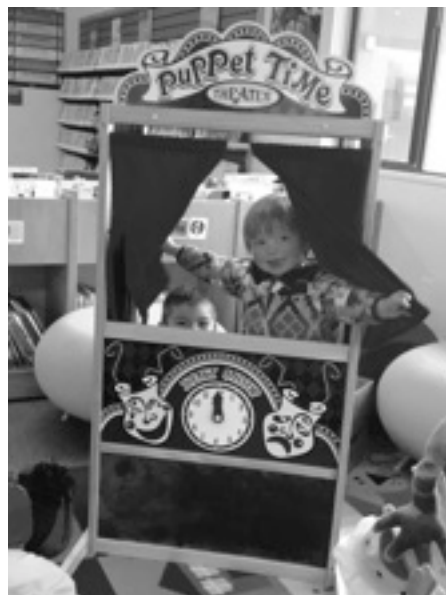
Lots of fun at the South Novato Library!