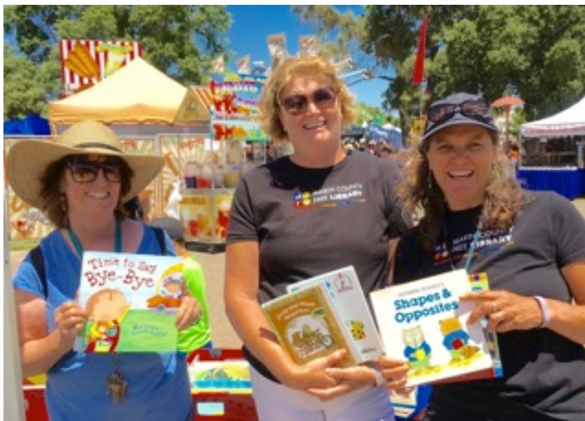
The Marin County Free Library at the County Fair!

To contact the Marin County Library: 415-499-6051 www.marinlibrary.org