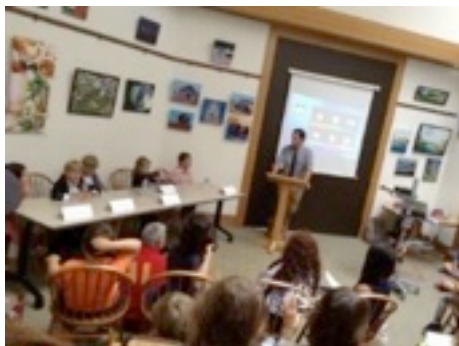
Panel discussion of books written by students from Cascade Canyon School.