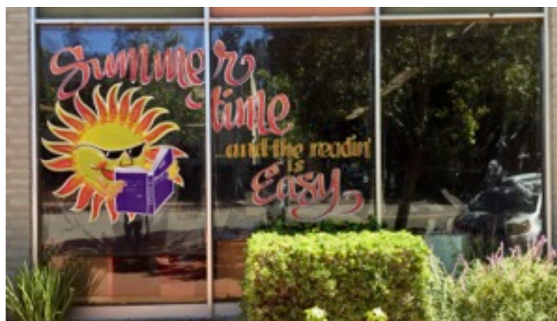
Summer window “splash” at the Book Place!