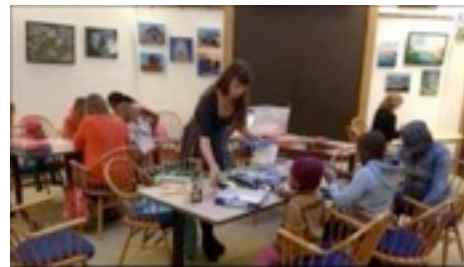
Playing board games at Fairfax.