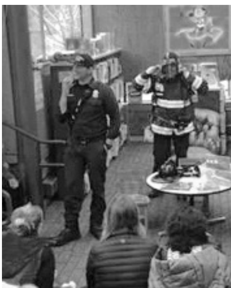
Firefighters wowing their audience at the Corte Madera Library.