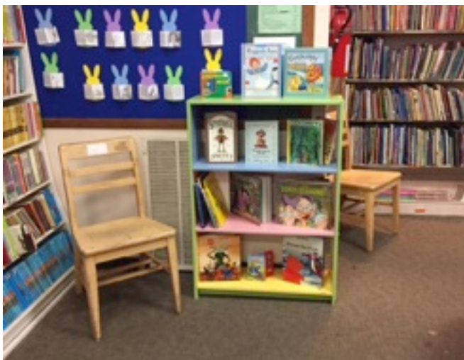
The Children's Room all spiffed up for spring.

Want to keep up with the latest? Follow us on Facebook at “The Book Place: Friends of Marin County Free Library;” Twitter “@friendsmarinlib;” and Instagram at “thebookplacenovato.”