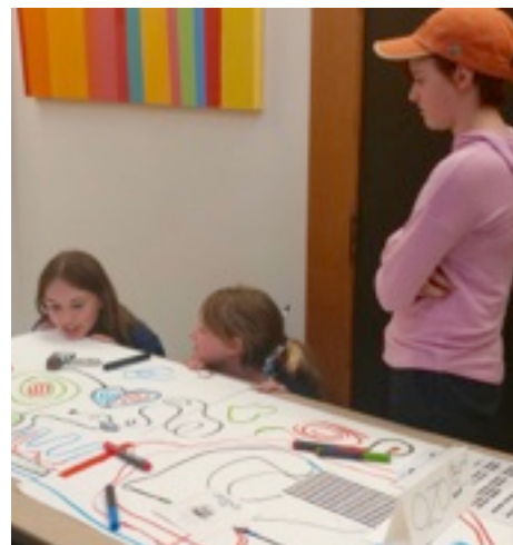
TEEN TECH TAKE-OVER at the Fairfax Library!

There are many more ongoing events. Visit the library to see all the coming events or visit www.marinlibrary.org . All events are free.