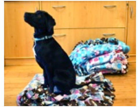
Boomer enjoying the new blankets at the Marin Humane Society.

In December the TAG made holiday cards for folks living in retirement homes. More recently, they have been planning every aspect of a family craft program for younger children over Spring Break on April 11. The Civic Center Friends support the TAG financially, while the County Friends of the Library fund programs open to all teens, including the $250 tuition for their participation in “Impact Bay Area,” a self-defense program.