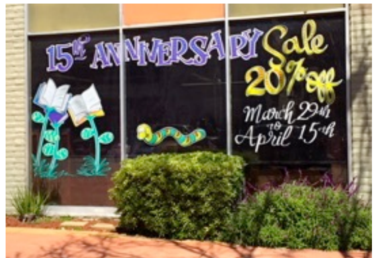
Window painting—what a great sign for our ongoing sale!