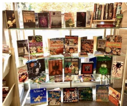
Lots of wonderful Halloween books!

Keep up with us via our website, marinlibraryfriends.org . We ALWAYS list what's on sale or specials, as well as our current hours. We're on Facebook at "The Book Place: Friends of Marin County Free Library;" Twitter "@friendsmarinlib;" and/or Instagram at "thebookplacenovato."