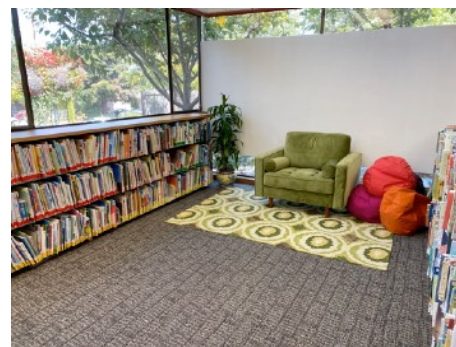
The updated children's room at Corte Madera Library.

The Corte Madera Friends are looking forward to the return of in-person visits to the branch. A celebration to mark the 50 th anniversary is being planned and we look forward to gathering with you then.