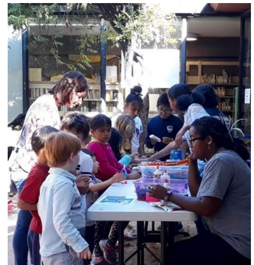
Plaza Nights Under the Summer Stars at the Novato Library.

inspiration and kind words and place your creations in your own garden or in a community garden.” The Marin City Library Teen Summer Challenge 2019 sponsored by the Marin City and County Friends and the San Francisco Giants started June 15 and ending August 10 urges teens to visit the library and earn scratcher tickets by checking out books, writing book reviews, and attending teen events.