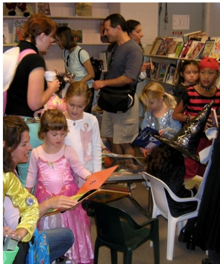
Trick or Treat in the Children's Room!