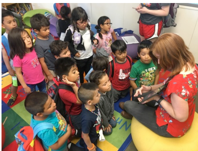
Camp University students learning about computers.