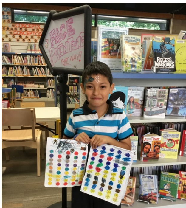
Super Reader at Unicorn and Rainbow Day—Novato Library