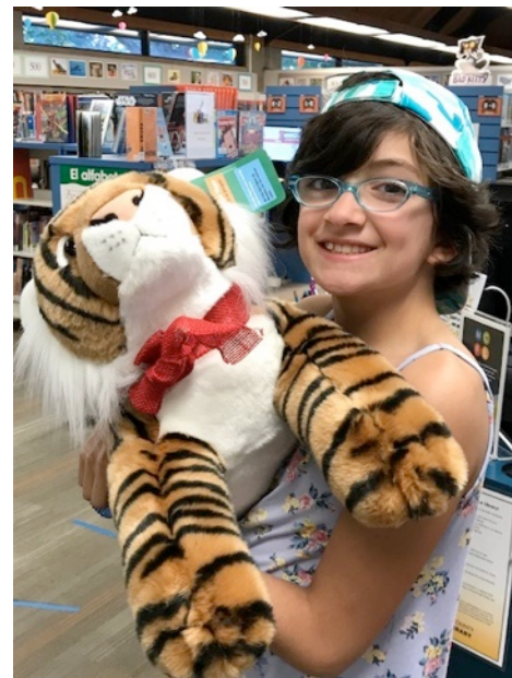
Whole Foods Tiger winner!