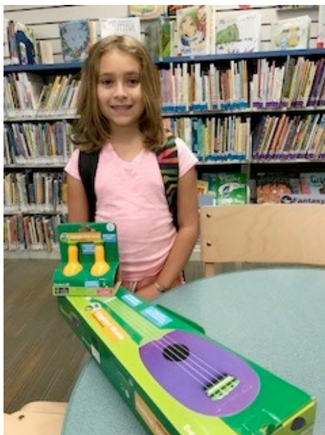
Whole Foods Instrument winner!

Whole Foods also provided prizes to the South Novato Library which greatly aided in serving NUSD's Camp University and the community at large. A huge shout out to Whole Foods for supporting the Novato Libraries and Summer Reading!