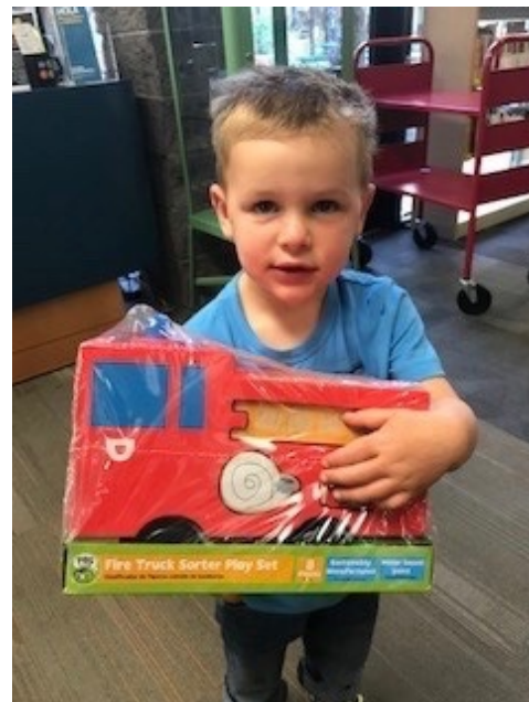
Prize-winners at Novato Library Summer Reading Challenge.