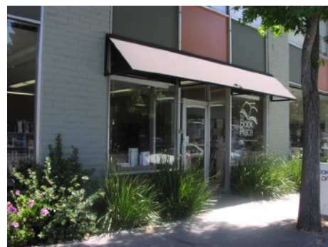
Starting our 20th year at 1608 Grant Avenue!