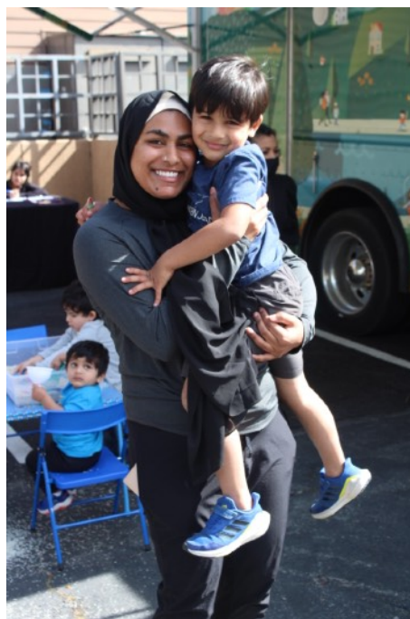
Library visitors looking forward to the Ramadan Storytime coming soon to the Marin City Library!