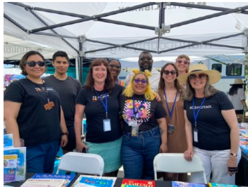
Library staff and Friends of the Library volunteers giving books to children at the Marin County Fair.

Thank you, Friends, for your continued support and engagement in our services and spaces. You help us to offer a tremendous summer experience at all our libraries and the County Fair! It truly is a pleasure to work with all of you in partnership of our excellent library system.