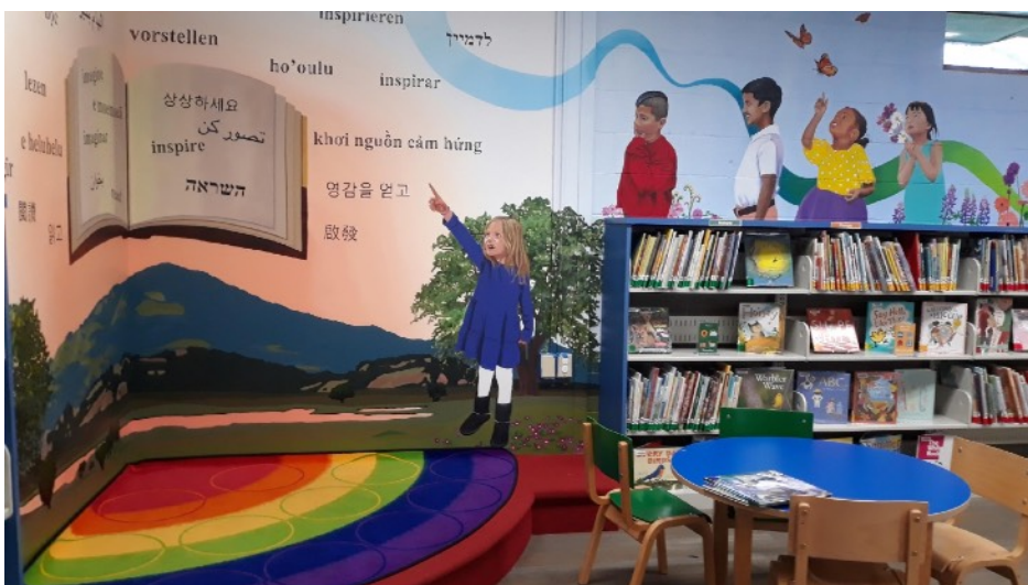
The beautiful new mural in the Children's Room—a terrific addition to the space!

All programs are free. Call 415-453-8151 for more information or visit www.marinlibrary.org .