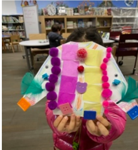
One entry in the Ugly Sweater contest. Could be a winner!

Marin County Free Library in cooperation with SURJ Marin (Showing Up for Racial Justice) is currently getting ready for our next Film and Conversation Series: "Race and Poverty" where we examine the connections between historical discrimination and poverty patterns on a local and national scale. Our next online event is taking place Saturday, January 21, 2023 at 2 pm. People can register for the event at www.tinyurl.com/RAPFC1