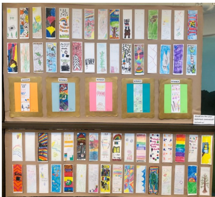
Beautiful book marks designed by our young people!